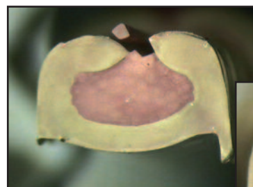
Gross Deformation of Crimped Terminal Resulting from Material Buildup in Crimper